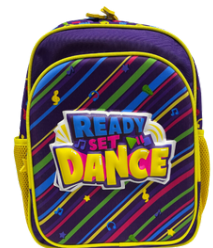
BACKPACK or SHOULDER BAG - $35