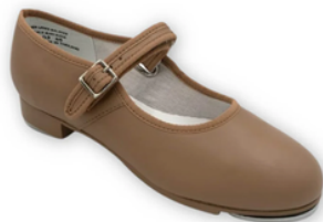
TAN BUCKLE (GIRLS) OR BLACK LACE UP (BOYS) TAP SHOES - $55