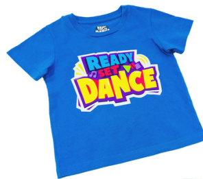
T SHIRT $25