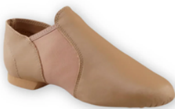
TAN (GIRLS) OR BLACK (BOYS) JAZZ SHOES - $45