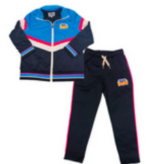
UNISEX TRACKSUIT $75