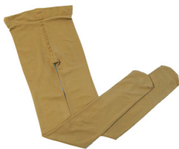
STOCKINGS / LEG WARMERS - $15