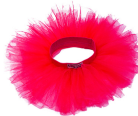
TULLE TUTU $25