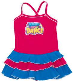
TUTU FRILL DRESS $50

All READY SET DANCE, READY SET BALLET, READY SET ACRO and READY SET MOVE students will be required to wear the official uniform that we are sure you will love. Below are some of the options that can be purchased from Avenue D. Jackets are available individually for $59 and trackpants for $35.