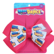
HAIR ACCESSORIES $8